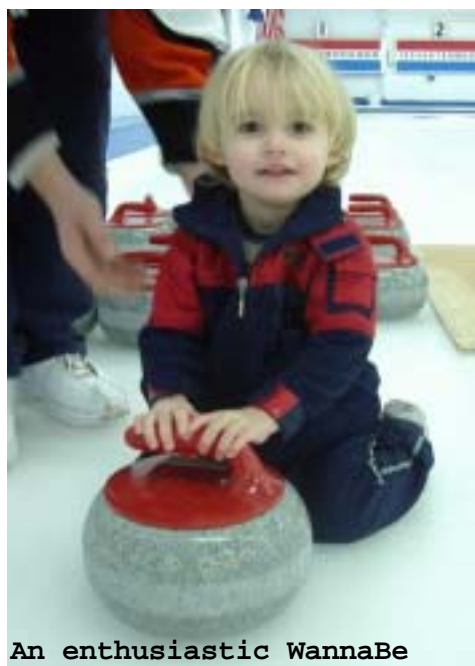
An enthusiastic WannaBe Curler!!