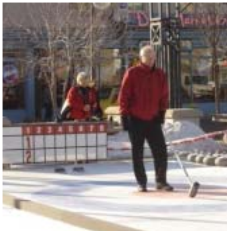
Curlers enjoy the Rotary Rink at the London Market