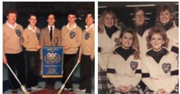
London Curling Club Ontario Junior champs from 1985 and 1989