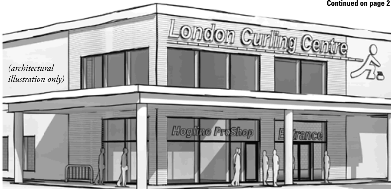
(architectural illustration only)