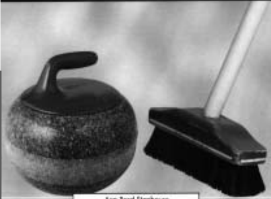
Aon Reed Sterhouse

Wishing you sweeping success in 2004/2005