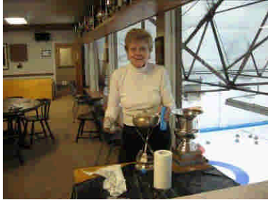
Even our President pitched in with cleaning duties!!